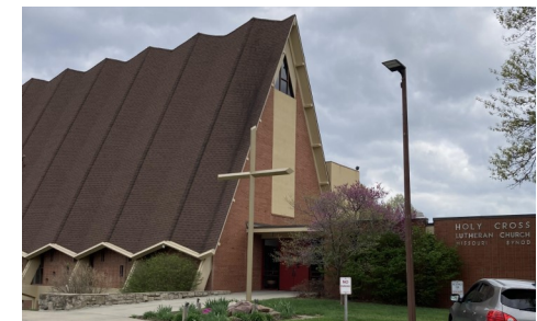
Holy Cross Lutheran Church